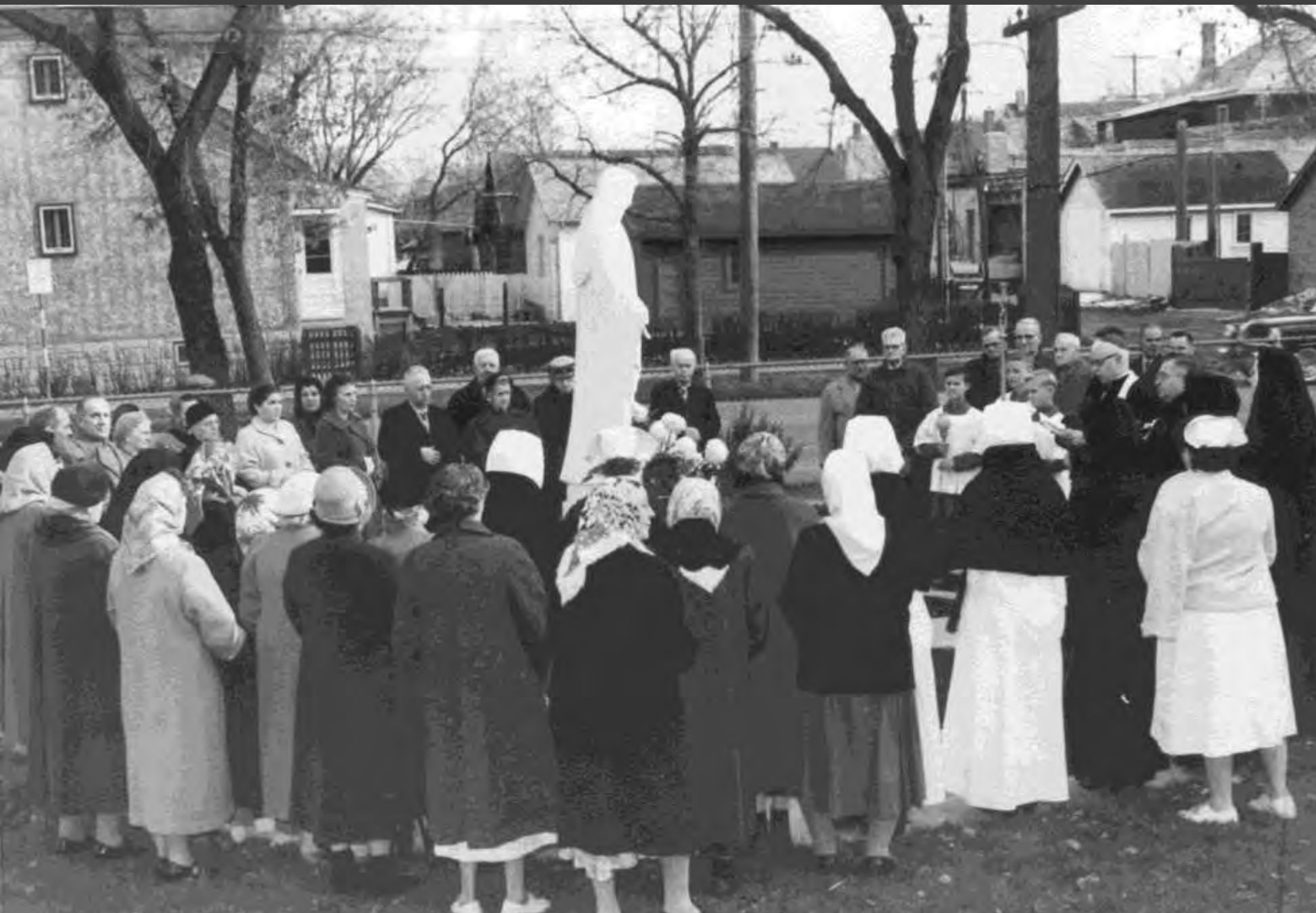
Sisters and residents gather around for the blessing of the Our Lady of Grace statue, 1959.