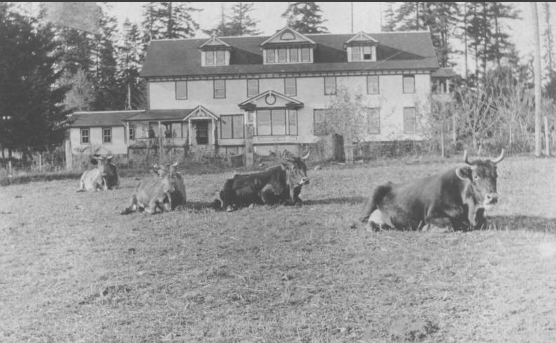
St. Joseph's General Hospital, (1915).