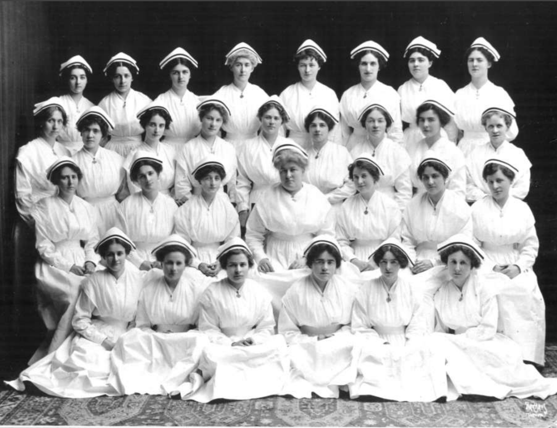
St. Michael's Hospital School of Nursing, graduating class of 1915