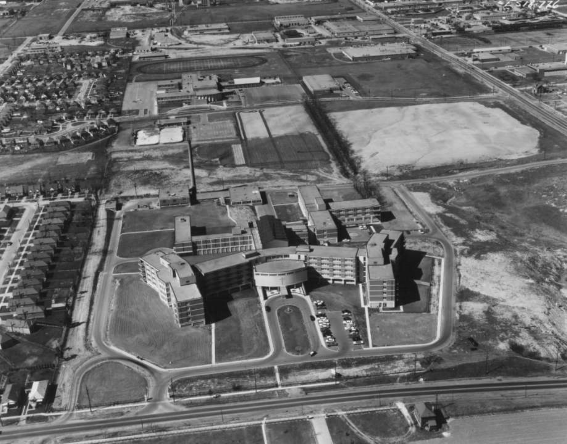
Aerial view of the new Providence Villa & Hospital in Scarborough, April 1963.