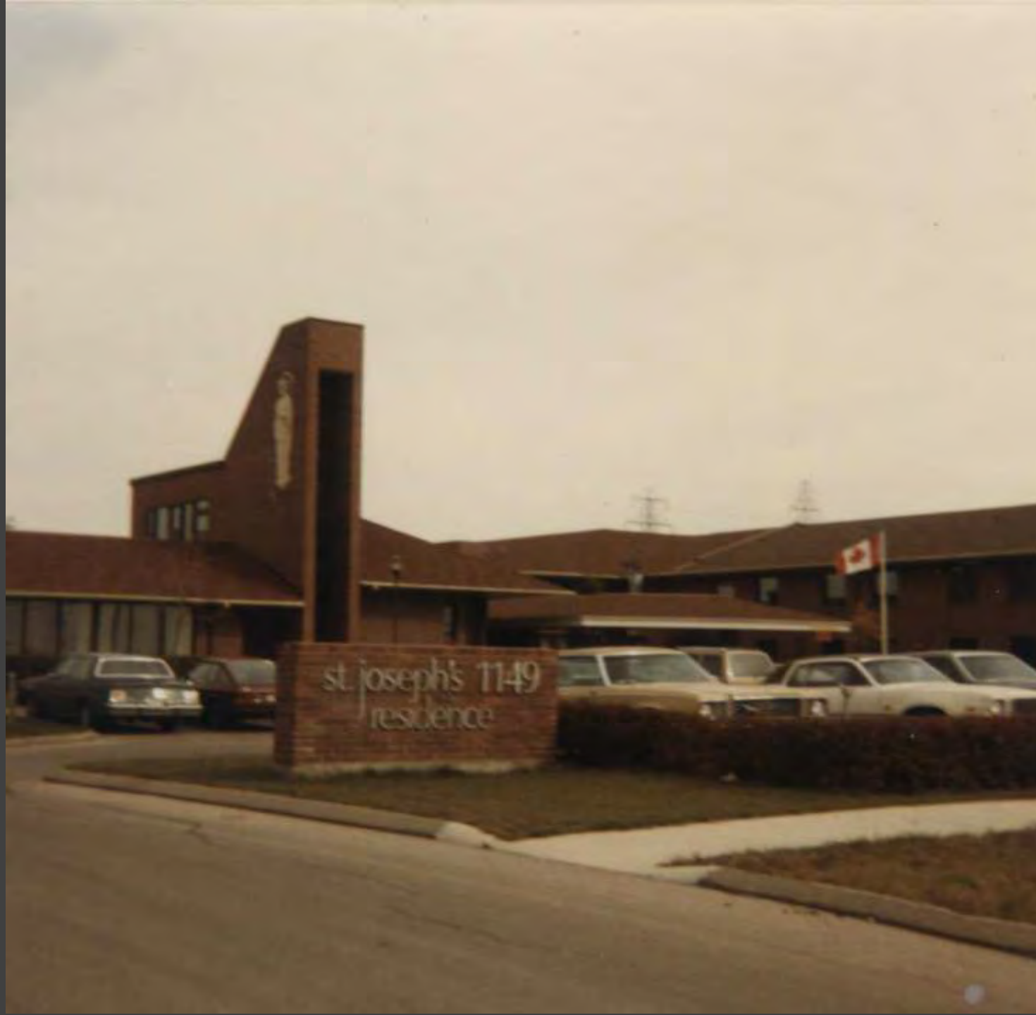
St. Joseph's Residence on Leila Avenue, May 1980.