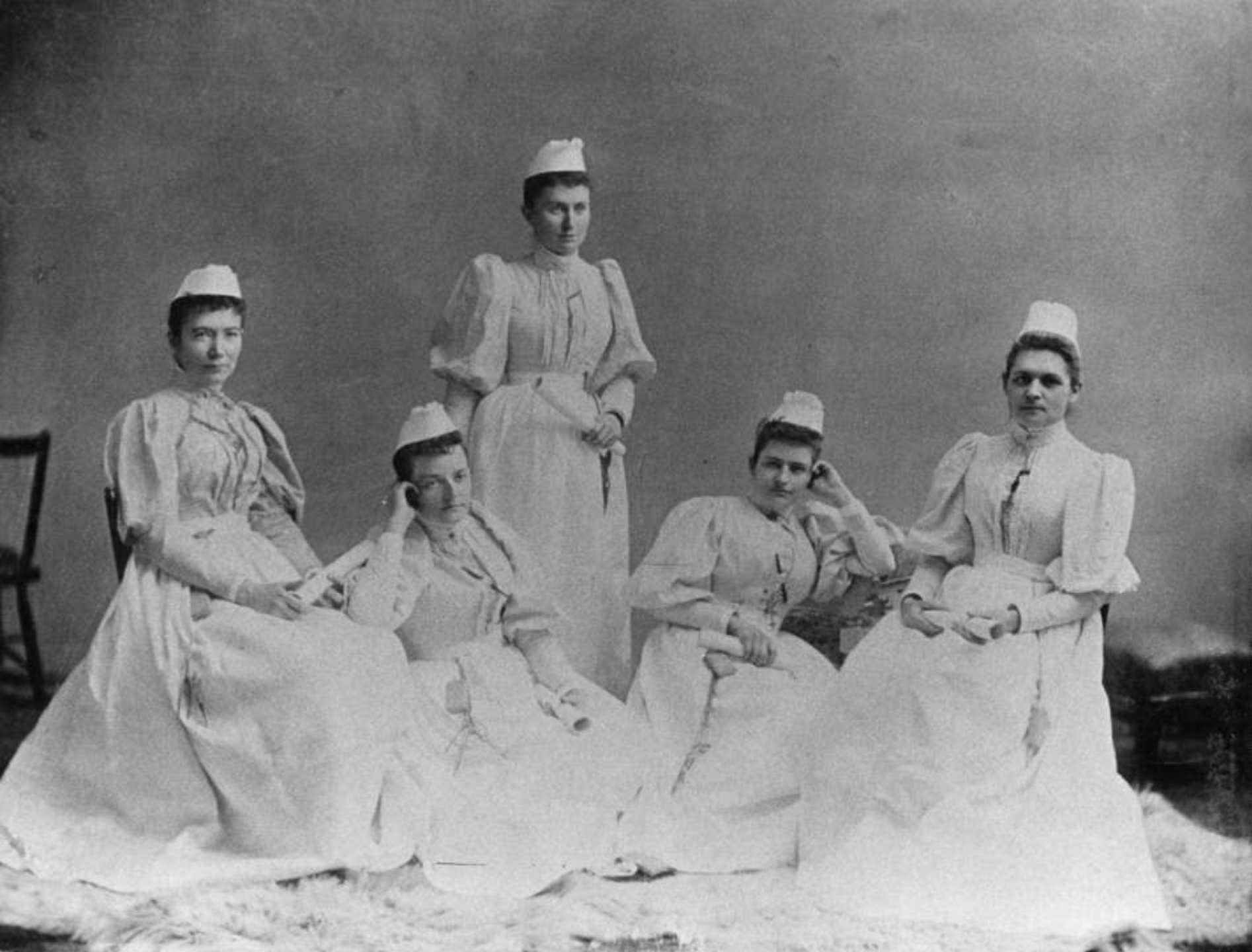
First graduating class of St. Michael's Hospital School of Nursing, 1894.