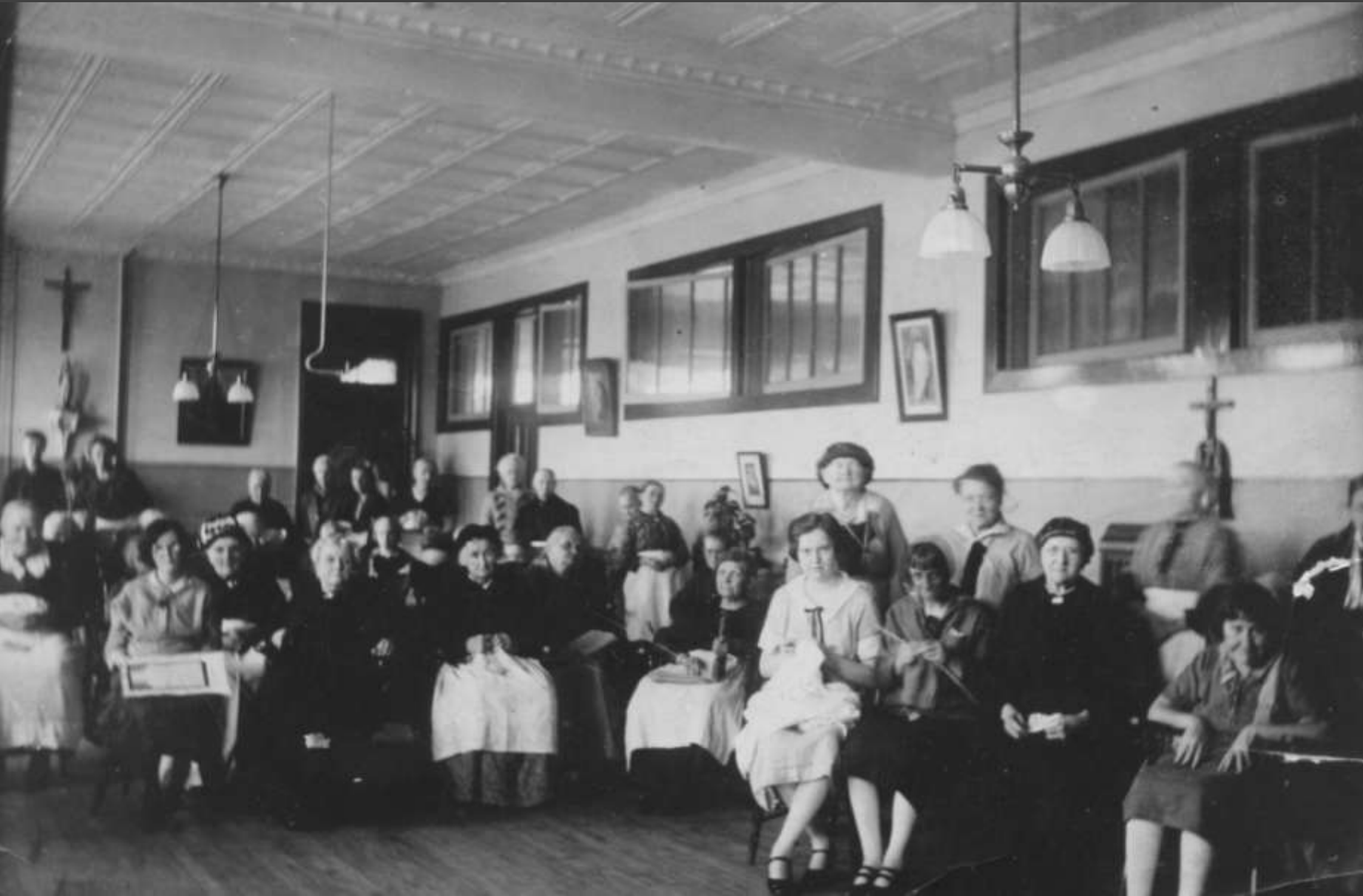
Female residents in the third floor sitting room in the 1940s.