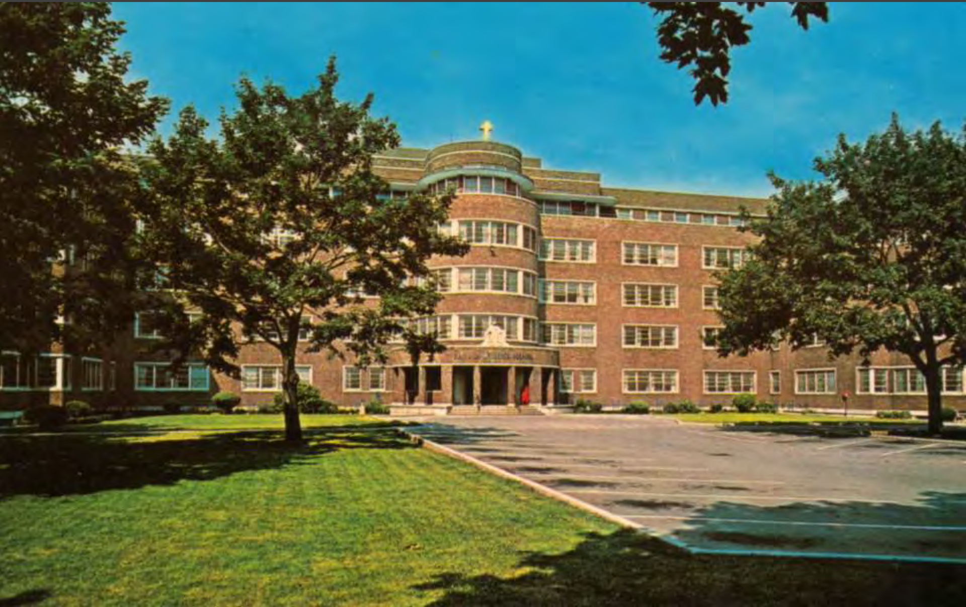
Our Lady of Mercy Hospital, (1970s).