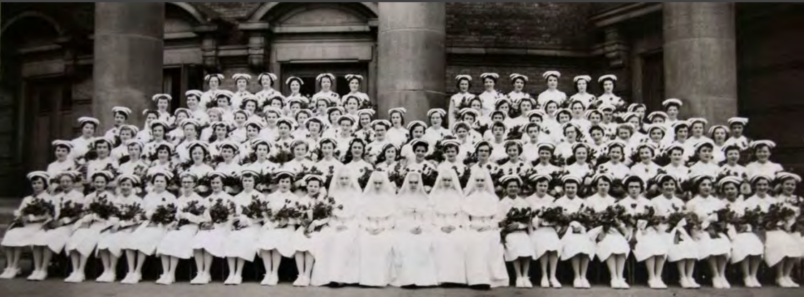
St. Michael's Hospital School of Nursing, graduating class of 1956