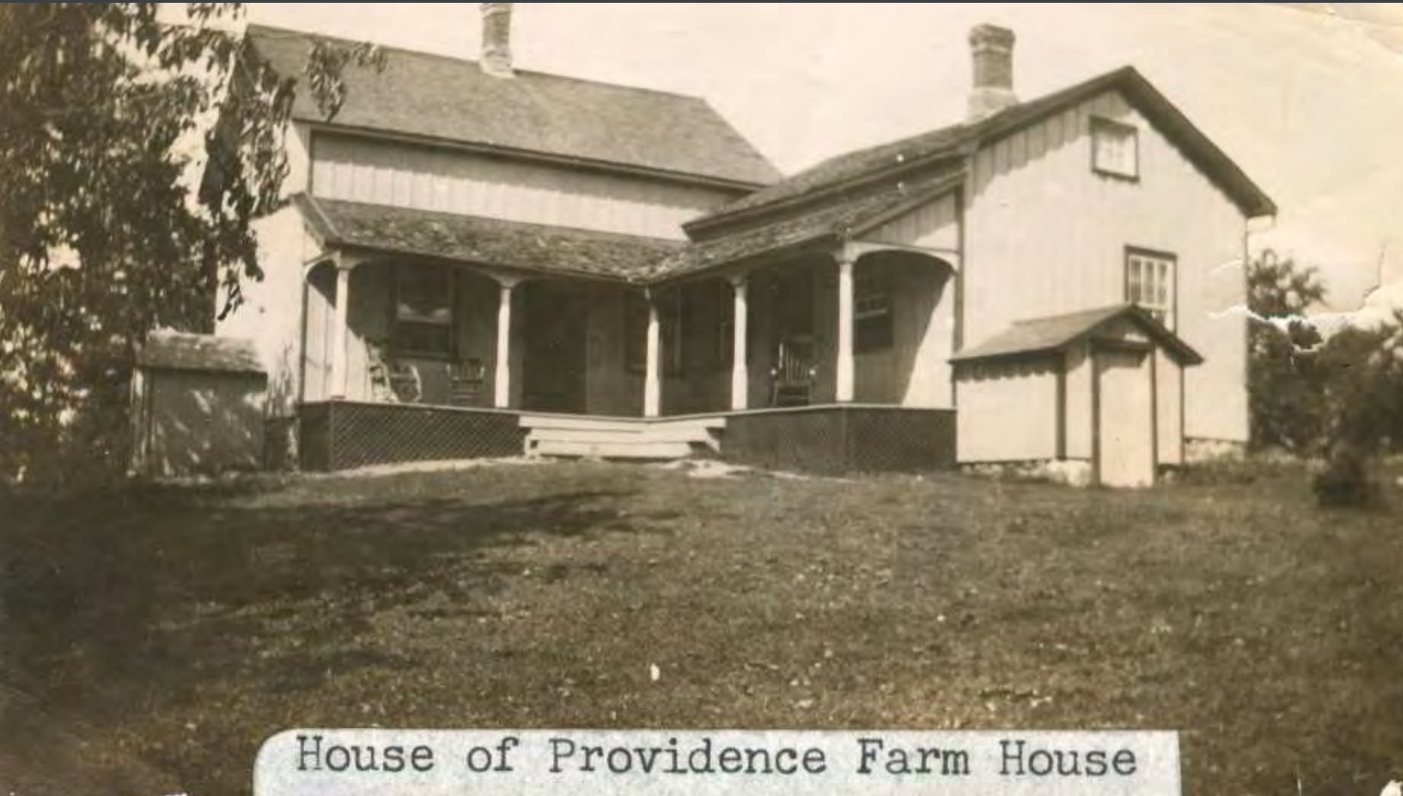
House of Providence Farm House

The House of Providence farmhouse, Scarborough, in 1925.