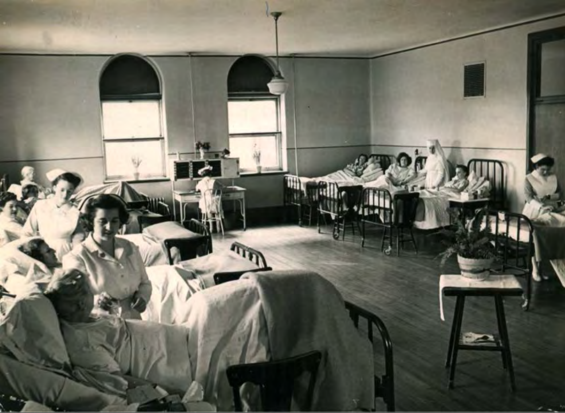
Nurses and patients in the public ward for women, (1930).