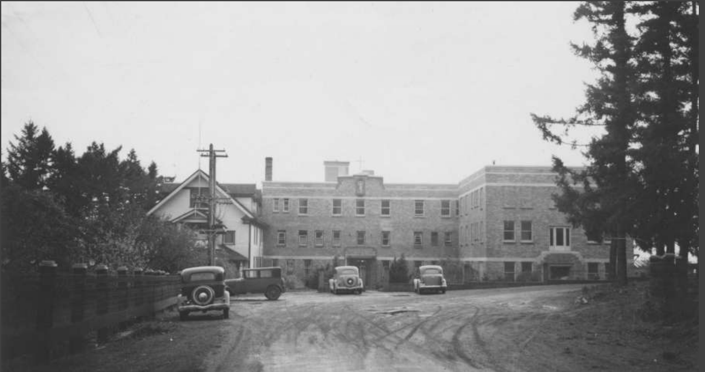
St. Joseph's General Hospital, Oct. 1937.

Left wing opened in 1914; Middle wing opened in 1924; Right wing opened in 1938.