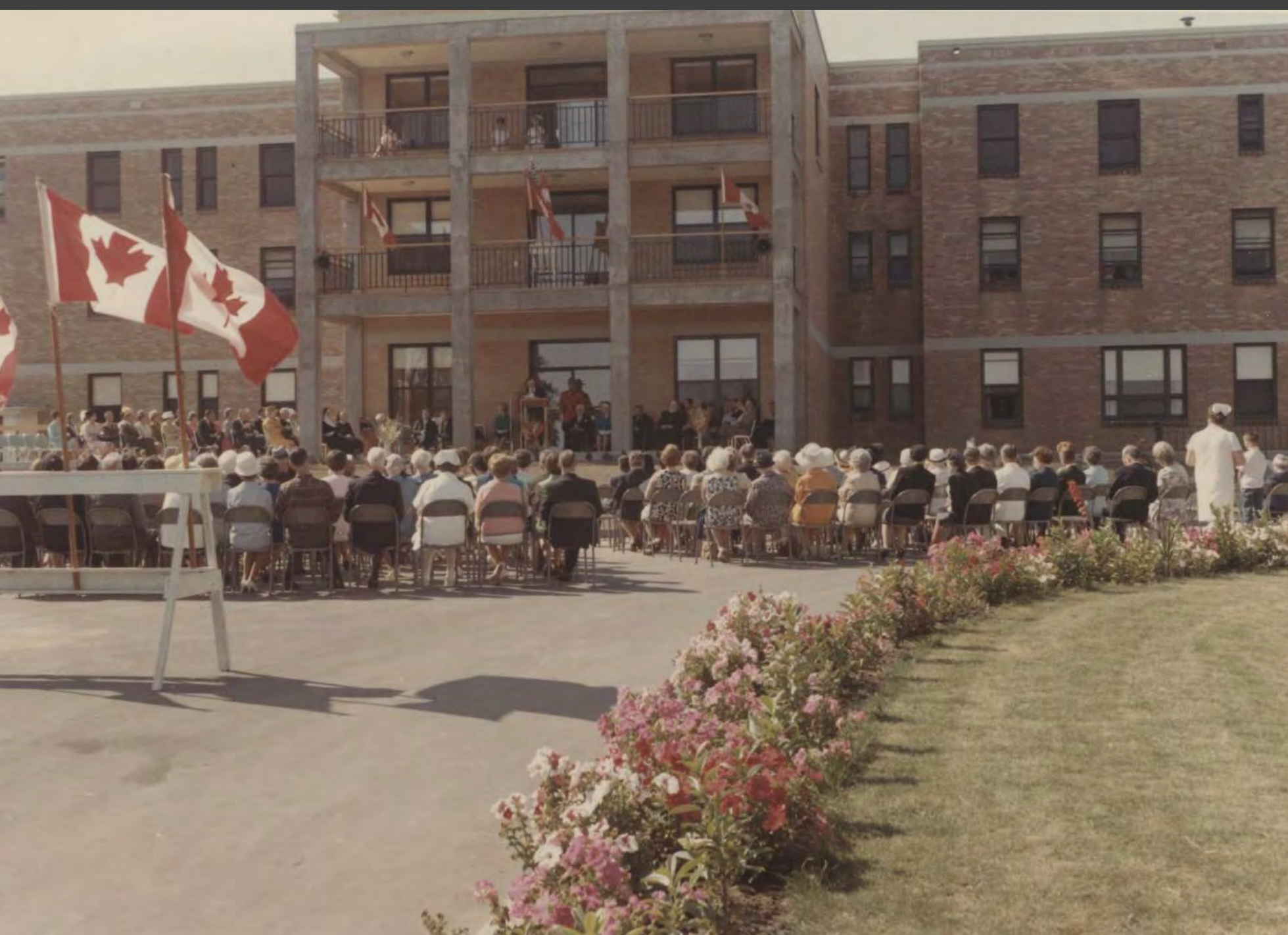
Opening of the new wing, June 17th, 1967