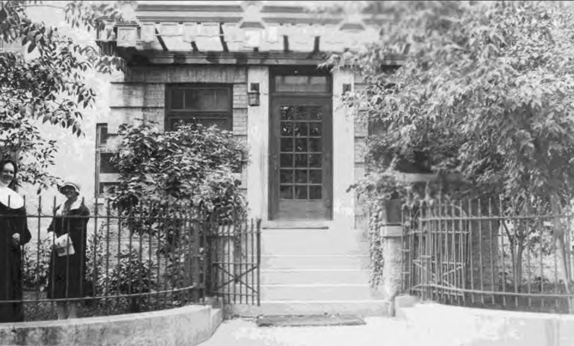
Original front entrance, 1929.