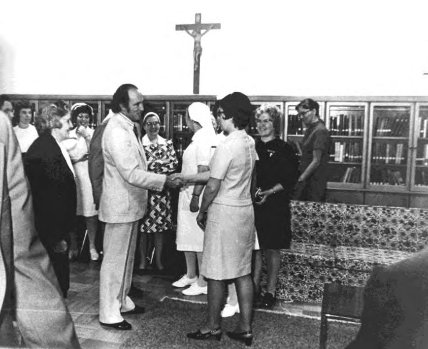
Prime Minister Pierre Trudeau during his visit to St. Joseph's Hospital, Sept. 29th, 1972.