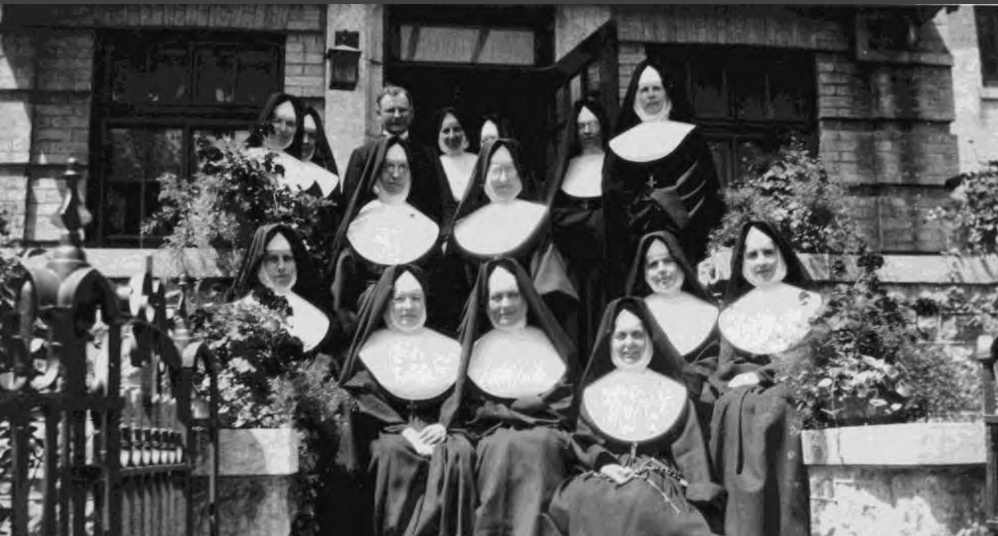
Sisters at the opening of St. Joseph's Hospital, July 2nd, 1923.