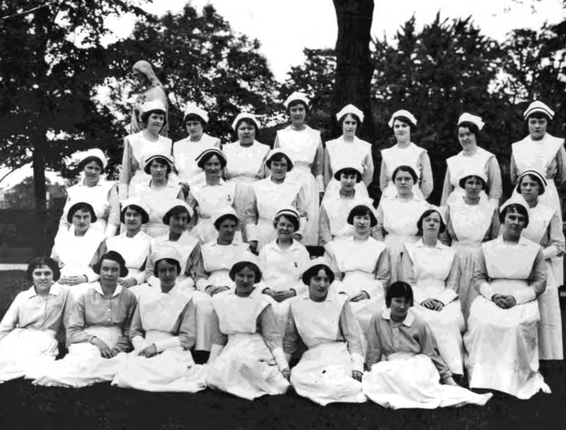
First graduates of the St. Joseph's Hospital School of Nursing, May 6th, 1924