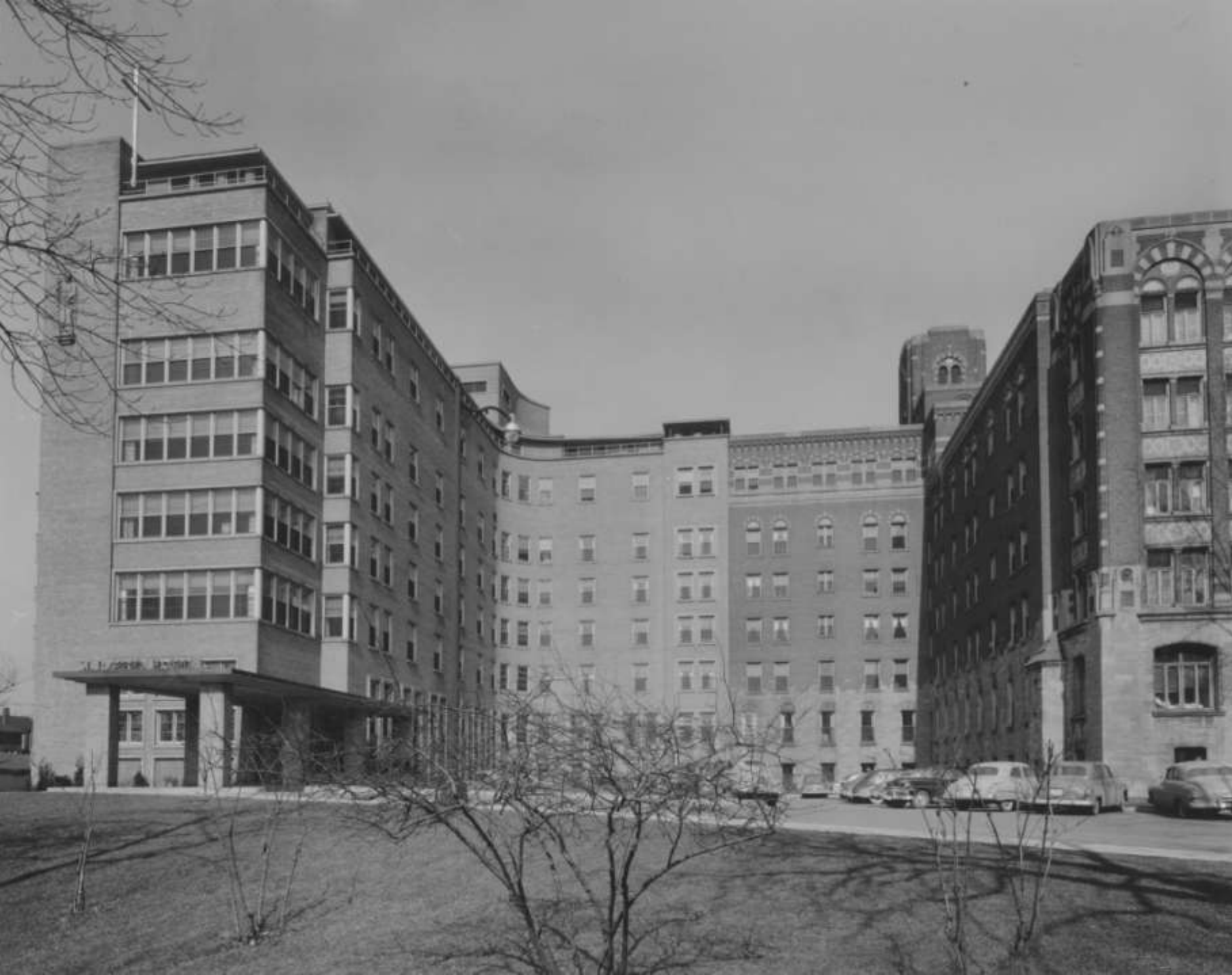
The Morrow (left) and East (right) wings, (1949).