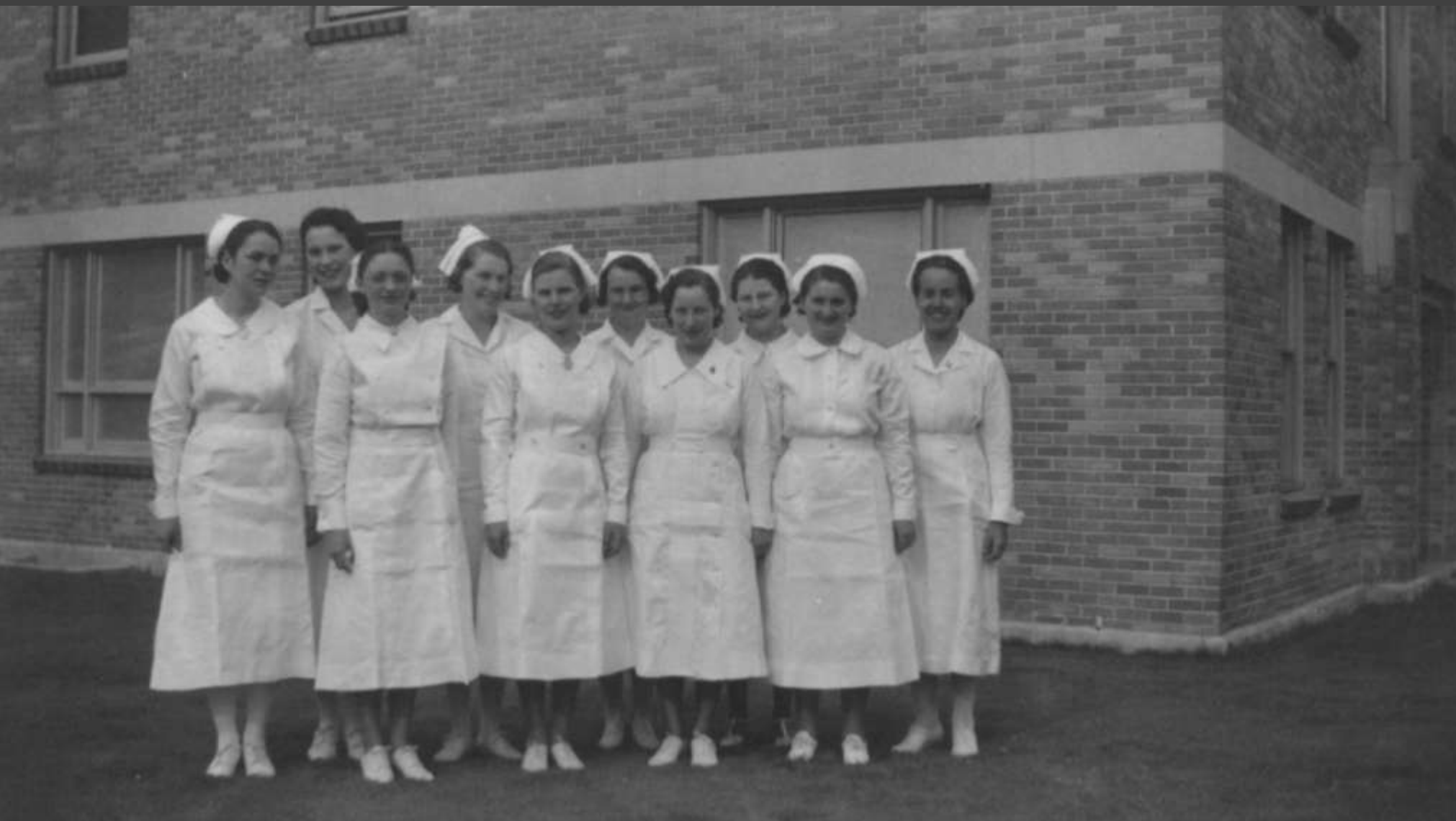
Nurses in front of the 1938 wing.