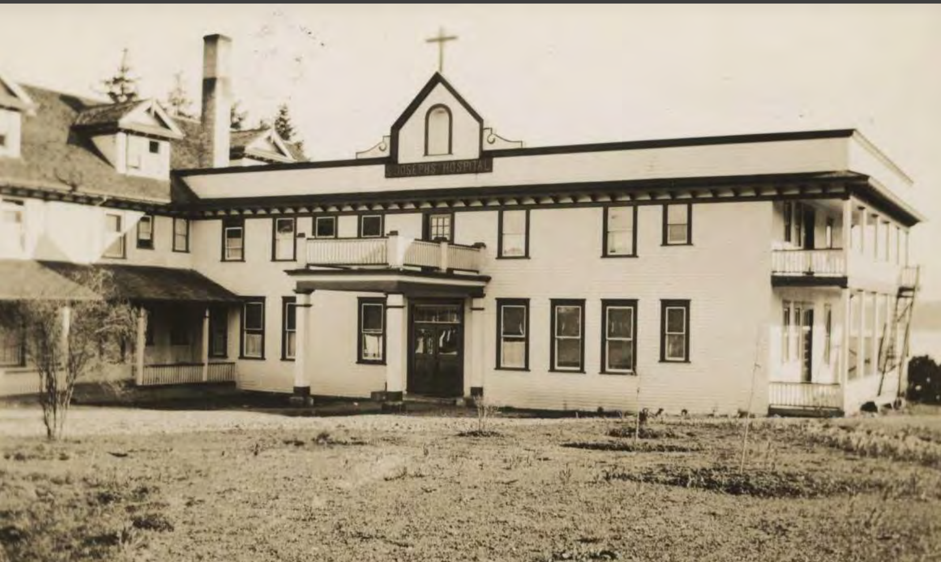
The first wing expansion, 1924. On the left is the 1915 hospital building.