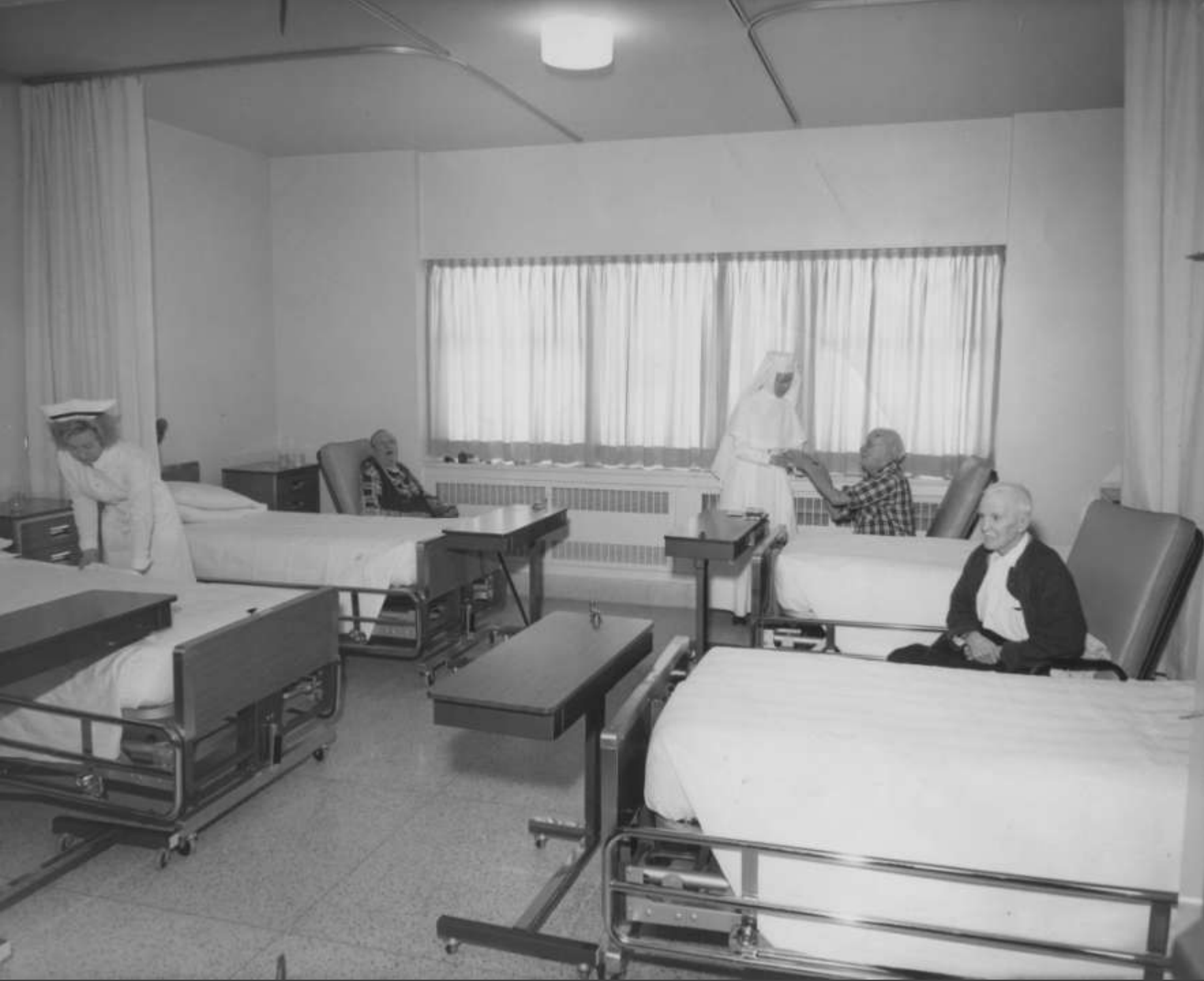
A Sister attends to a resident in the men's ward of the new Providence Villa, 1962.