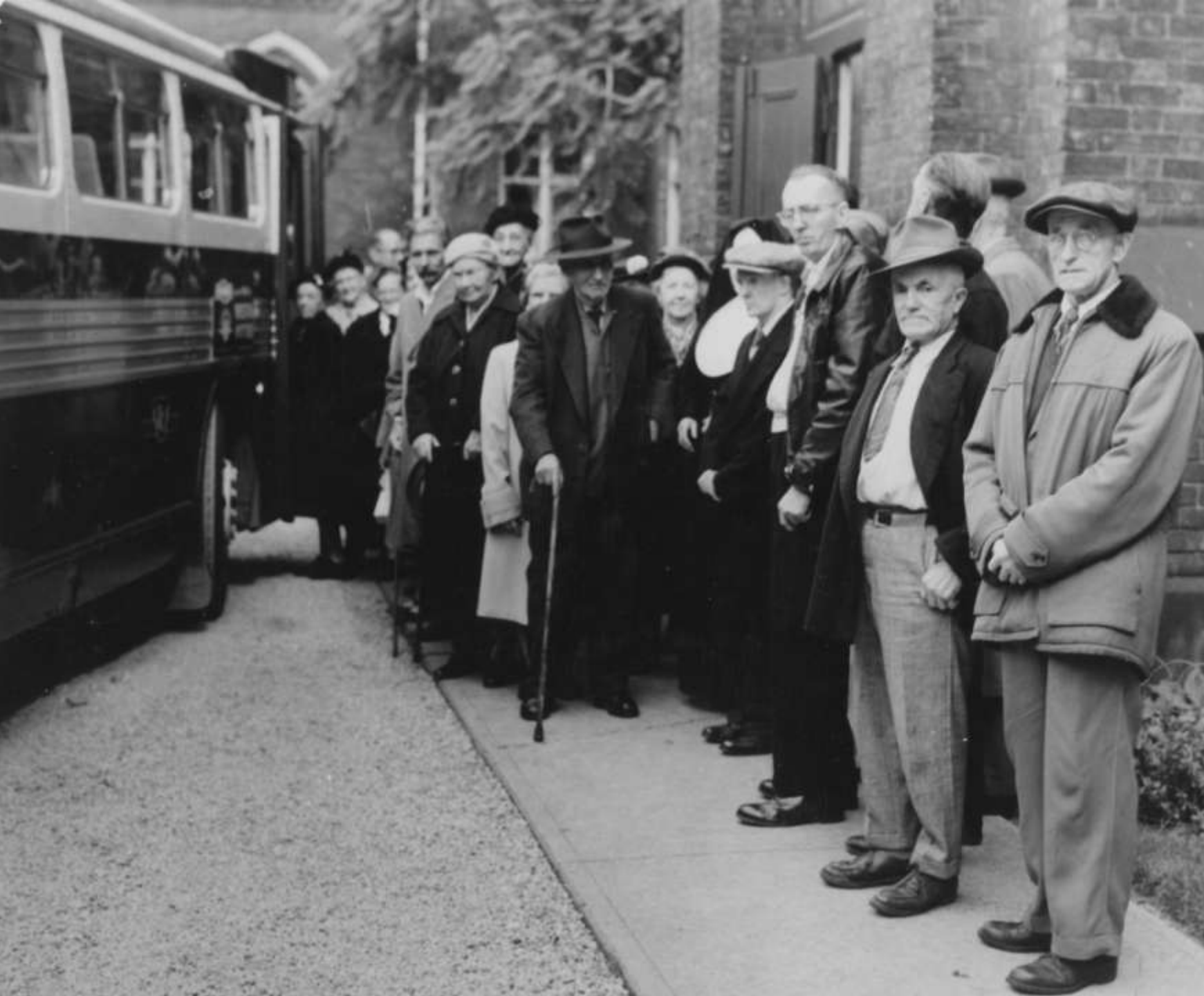
Residents prepare to board a bus outside the House of Providence, possibly for an outing on Rosary Sunday, in the 1940s.