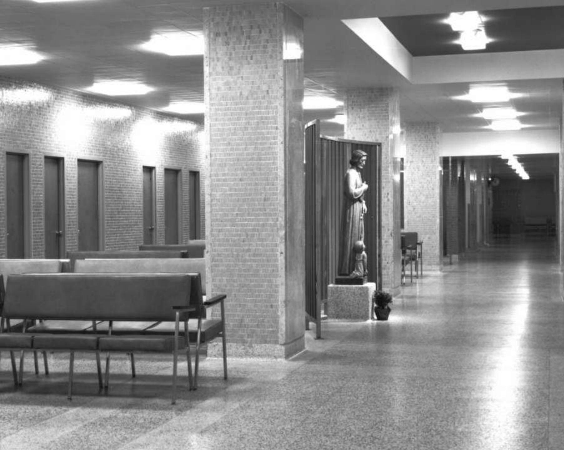
Side view of the entrance to Glendale Wing, opened in 1961, with the Out Patient Department on the ground floor.