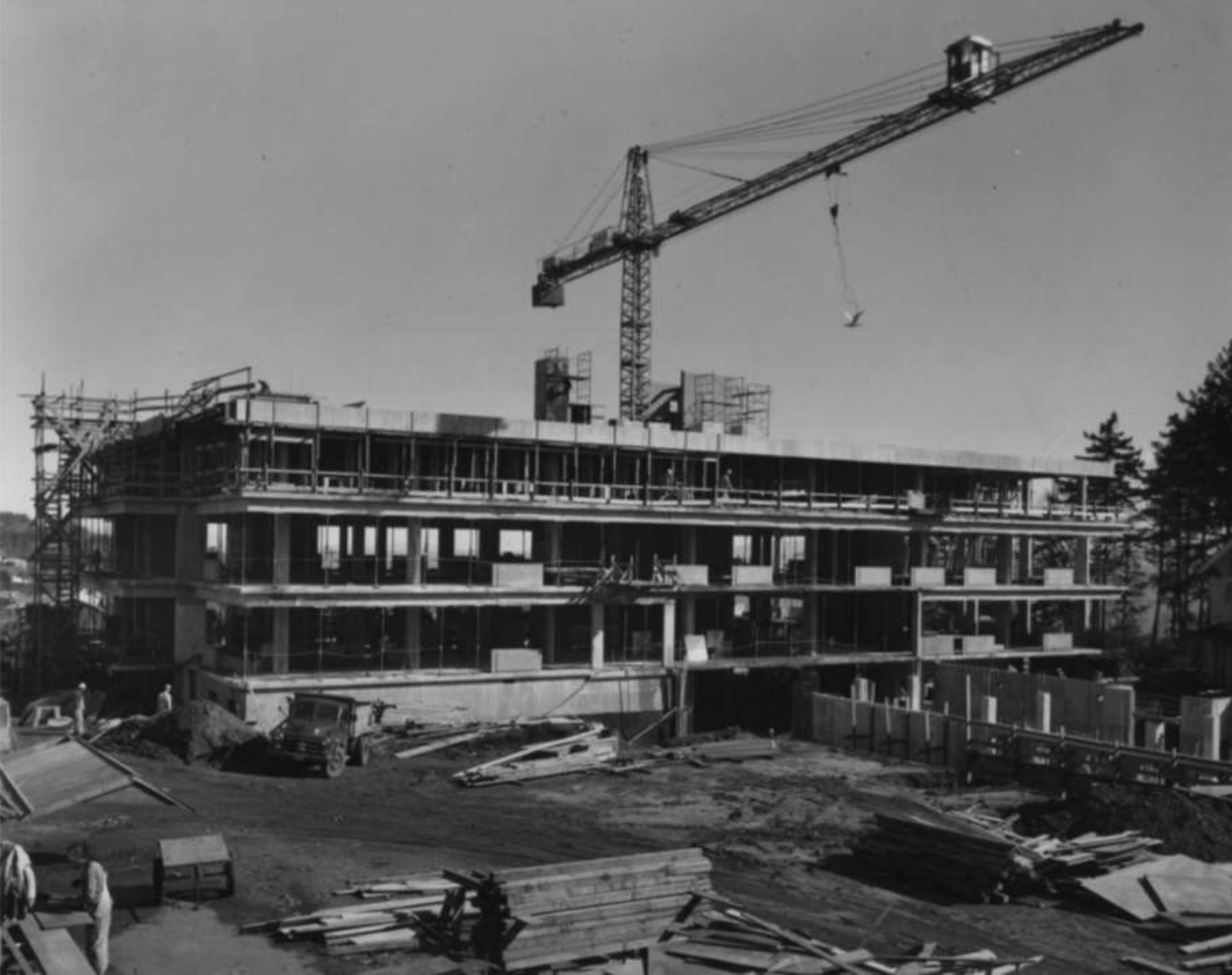
New St. Joseph's General Hospital wing under construction, March 22, 1966.