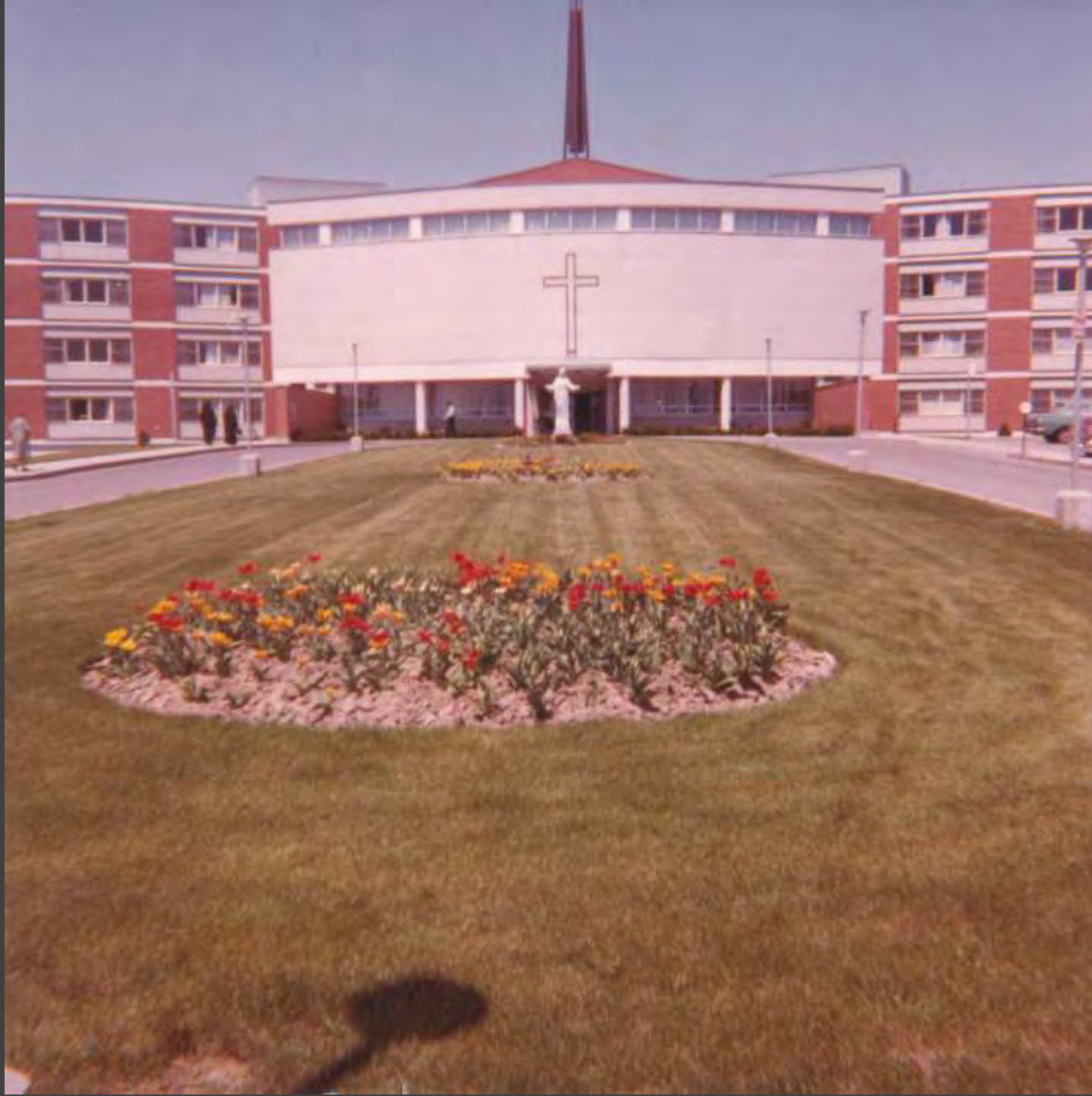
Providence Villa façade in the 1970s.