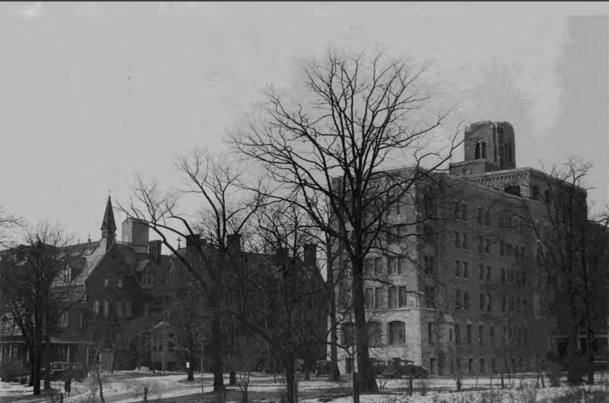
On the left: Sacred Heart Orphanage (until 1921); on the right: the new East Wing of St. Joseph's Hospital, opened in 1931.