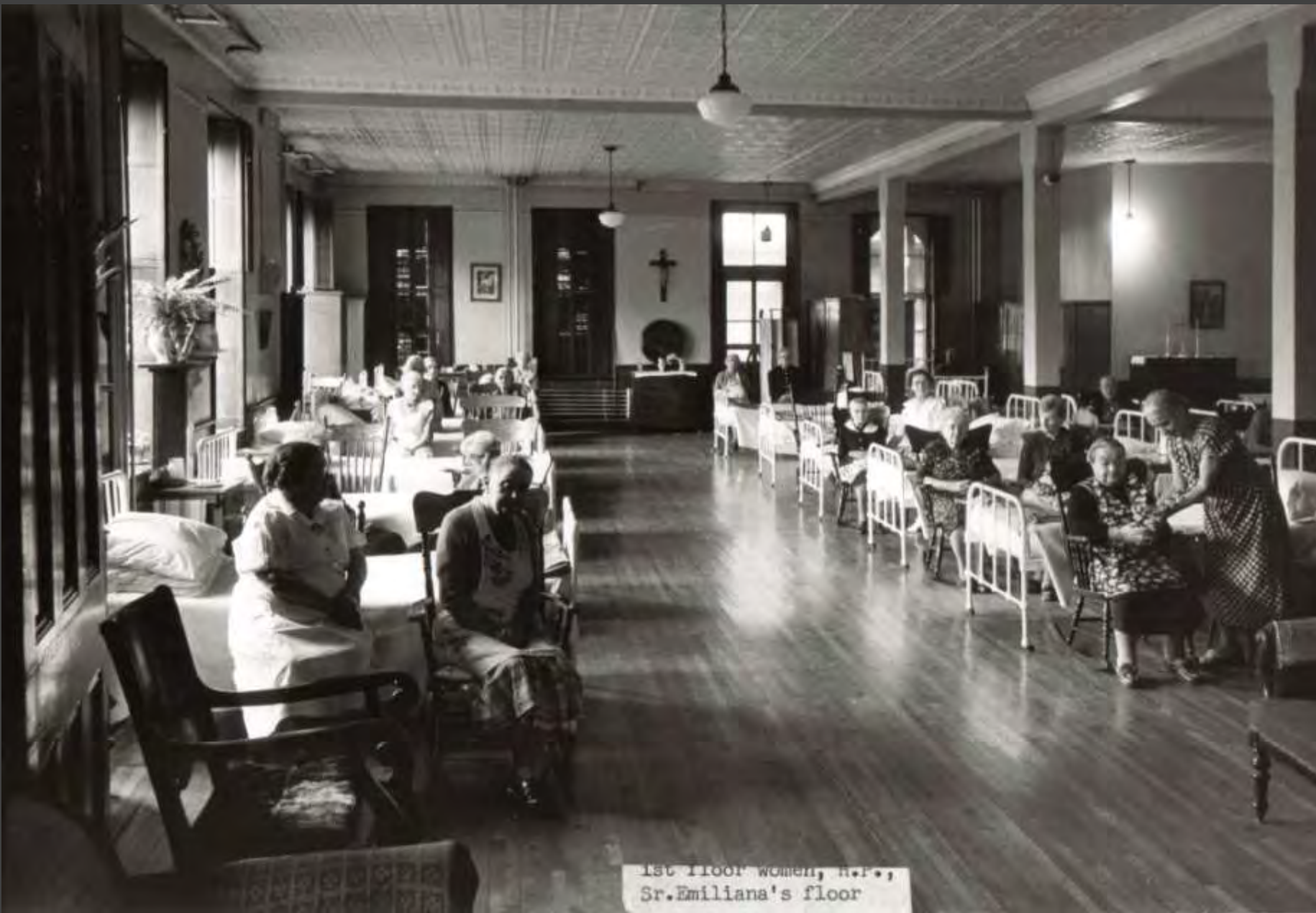
Women's wing on the first floor (1958).