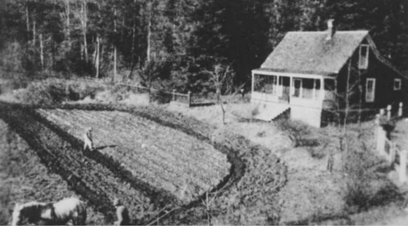
The four-bed cottage which served as the first St. Joseph's Hospital in Comox, (1913).