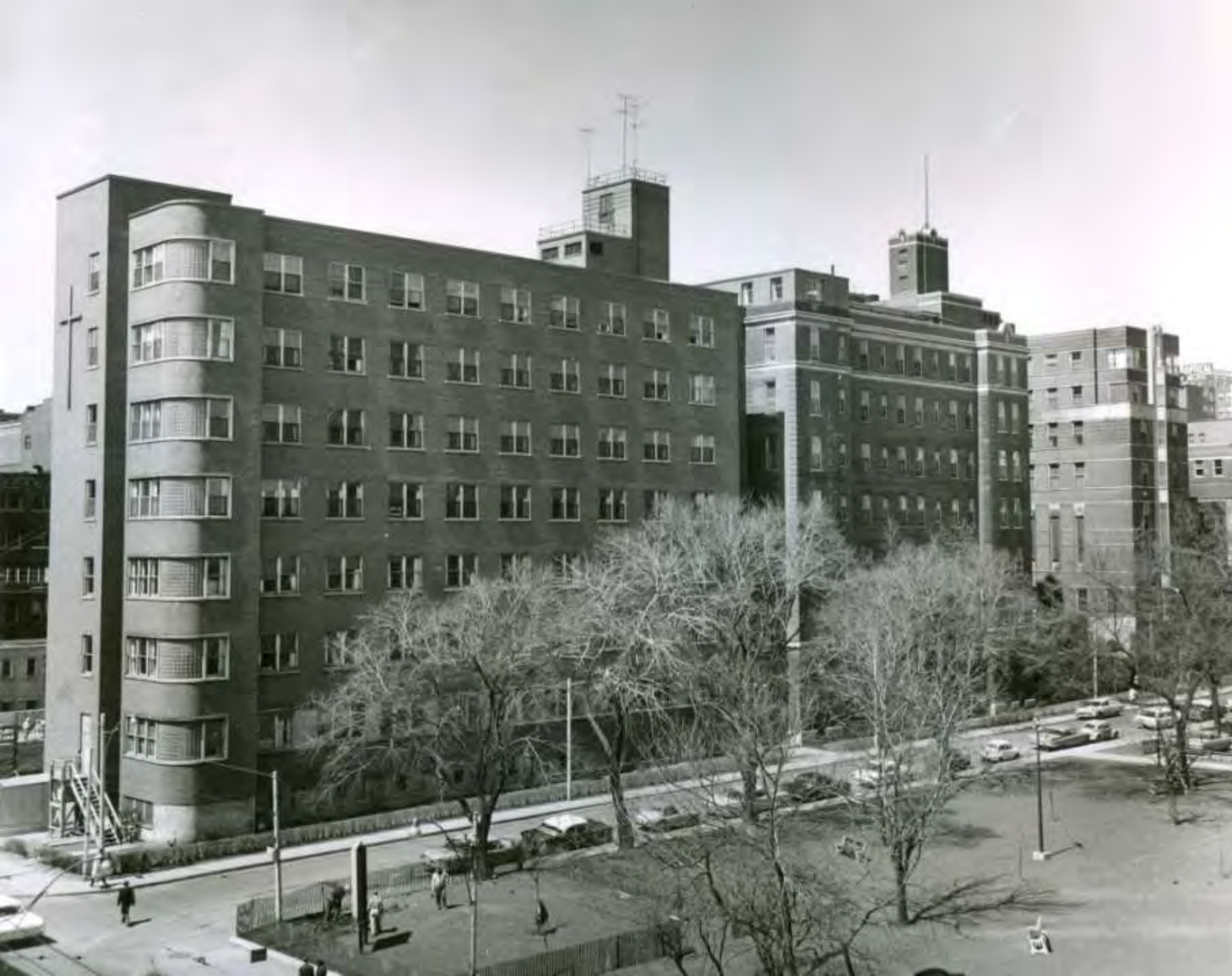
St. Michael's Hospital, (1950s).