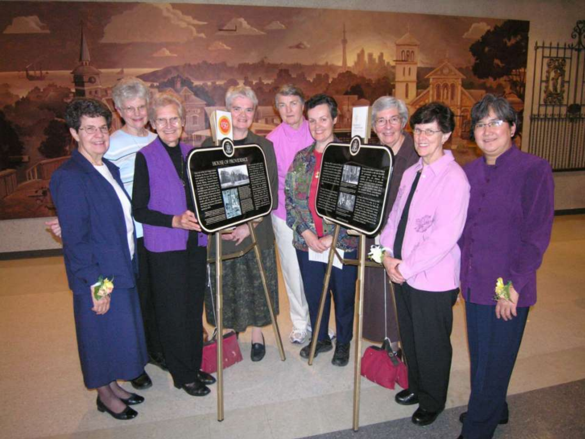
Sisters at the unveiling of the Heritage Toronto Plaque for the 150 th anniversary of Providence Health Care in 2007.